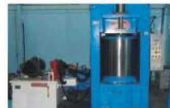
Cold Isostatic Press